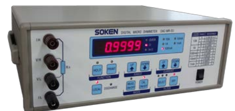
Desk Top Type: DAC-MR-2U

Size & weight: W370xH132xD370, Approx. 6.3kg